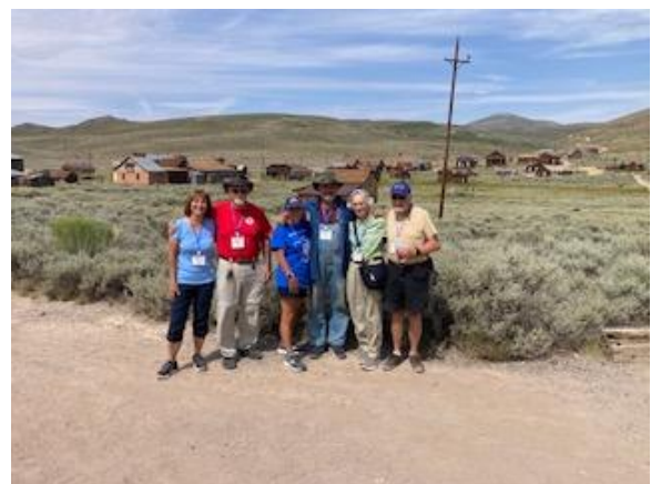
Ryan Ramble photos courtesy of the O'Connors