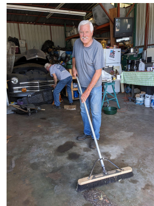
"Clean Up"

In the Land of the Awful Waffle, things are going "slowly but surely." The engine still needs attention to find the cause of that "knocking" noise. Mac has progressed well with the upholstery, but the steering alignment needs work. No Awful Waffle this Friday, April 26, because of the Transportation Fair.