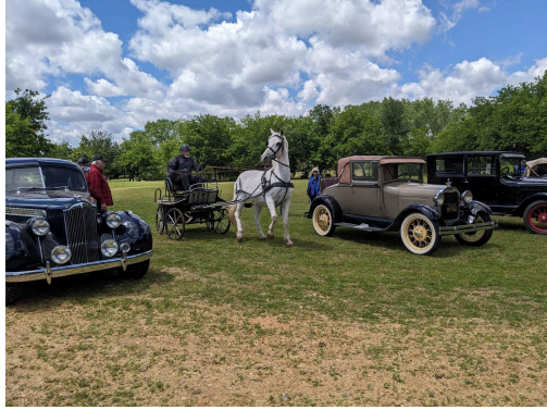
Old "Horse Power"